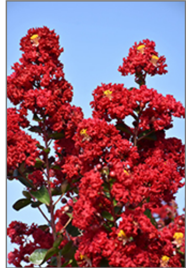
Double Dynamite Crapemyrtle flowers

This shrub does best in full sun to partial shade. It prefers to grow in average to moist conditions, and shouldn't be allowed to dry out. It is very fussy about its soil conditions and must have rich, acidic soils to ensure success, and is subject to chlorosis (yellowing) of the foliage in alkaline soils. It is highly tolerant of urban pollution and will even thrive in inner city environments. This is a selected variety of a species not originally from North America.