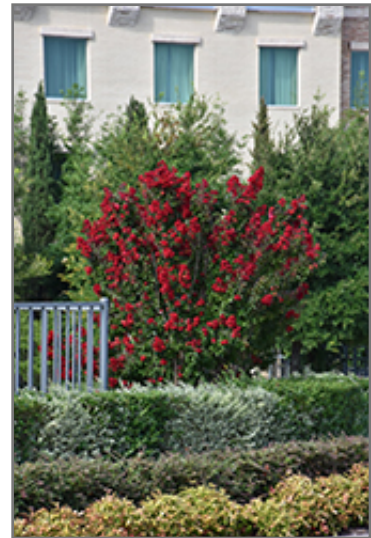
Double Dynamite Crapemyrtle in bloom

This shrub does best in full sun to partial shade. It prefers to grow in average to moist conditions, and shouldn't be allowed to dry out. It is very fussy about its soil conditions and must have rich, acidic soils to ensure success, and is subject to chlorosis (yellowing) of the foliage in alkaline soils. It is highly tolerant of urban pollution and will even thrive in inner city environments. This is a selected variety of a species not originally from North America.