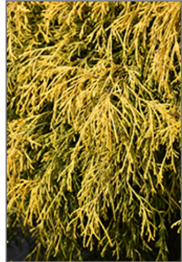
Paul's Gold Threadleaf Falsecypress foliage

Paul's Gold Threadleaf Falsecypress is recommended for the following landscape applications;