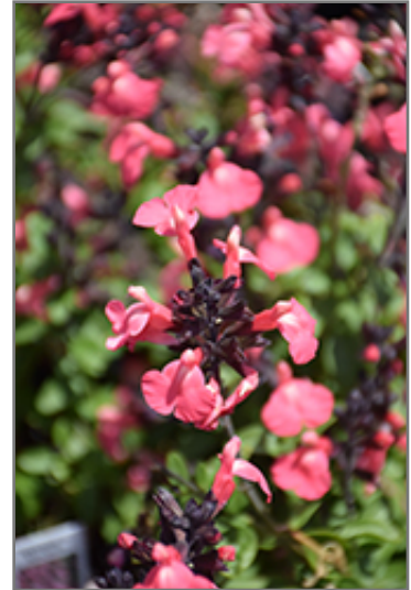
Mirage Salmon Autumn Sage flowers

Mirage Salmon Autumn Sage is recommended for the following landscape applications;