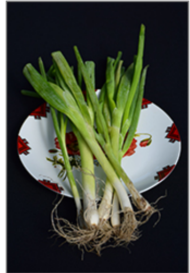
Spring Onion fruit