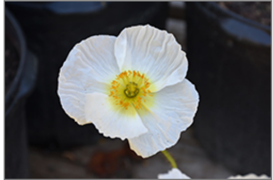
Champagne Bubbles White Poppy flowers