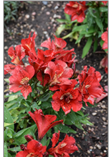
Colorita Kate Alstroemeria flowers