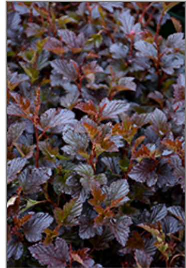
Petite Plum Ninebark foliage