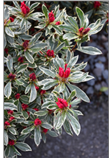
Silver Sword Azalea foliage