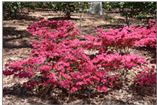
Hinode-giri Azalea in bloom