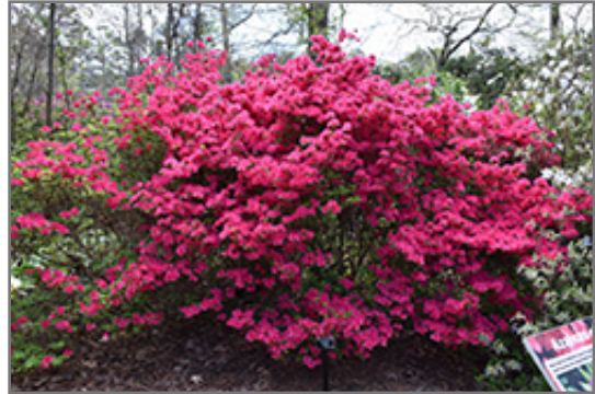
Hinode-giri Azalea in bloom

This shrub does best in full sun to partial shade. You may want to keep it away from hot, dry locations that receive direct afternoon sun or which get reflected sunlight, such as against the south side of a white wall. It requires an evenly moist well-drained soil for optimal growth, but will die in standing water. It is very fussy about its soil conditions and must have rich, acidic soils to ensure success, and is subject to chlorosis (yellowing) of the foliage in alkaline soils. It is somewhat tolerant of urban pollution, and will benefit from being planted in a relatively sheltered location. Consider applying a thick mulch around the root zone in winter to protect it in exposed locations or colder microclimates. This particular variety is an interspecific hybrid.