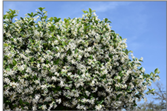
Madison Star-Jasmine flowers