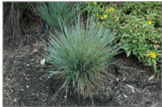
Standing Ovation Bluestem