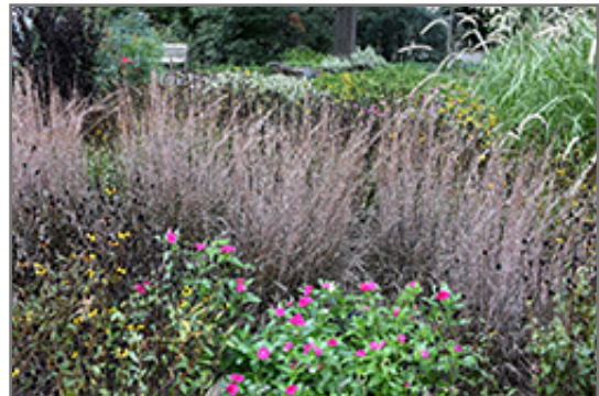
Standing Ovation Bluestem in fall