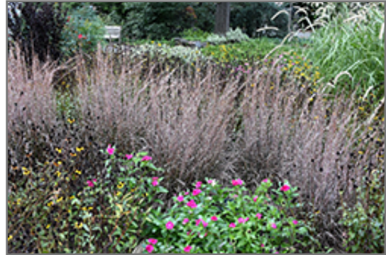
Standing Ovation Bluestem in fall