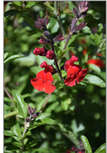
Radio Red Autumn Sage flowers