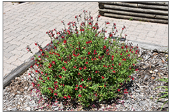
Radio Red Autumn Sage in bloom