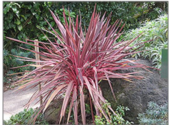
Electric Pink Cordyline

Electric Pink Cordyline is recommended for the following landscape applications;