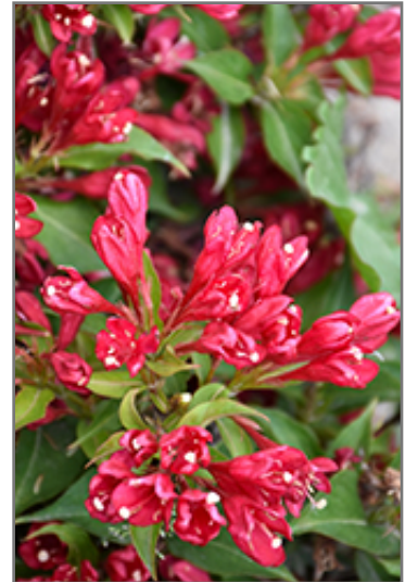
Crimson Kisses Weigela flowers