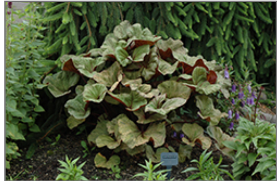
Garden Confetti Rayflower