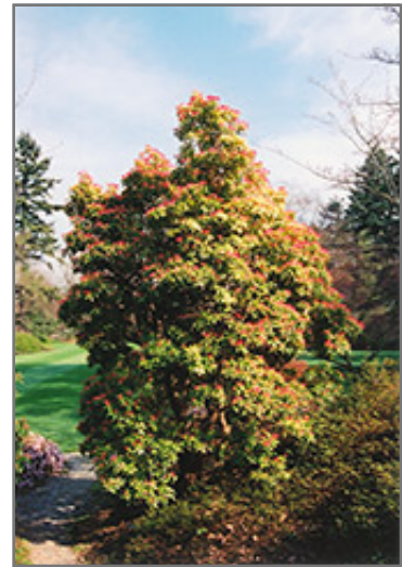
Valley Fire Japanese Pieris

This shrub does best in full sun to partial shade. It requires an evenly moist well-drained soil for optimal growth, but will die in standing water. It is very fussy about its soil conditions and must have rich, acidic soils to ensure success, and is subject to chlorosis (yellowing) of the foliage in alkaline soils. It is somewhat tolerant of urban pollution, and will benefit from being planted in a relatively sheltered location. Consider applying a thick mulch around the root zone in winter to protect it in exposed locations or colder microclimates. This is a selected variety of a species not originally from North America, and parts of it are known to be toxic to humans and animals, so care should be exercised in planting it around children and pets.