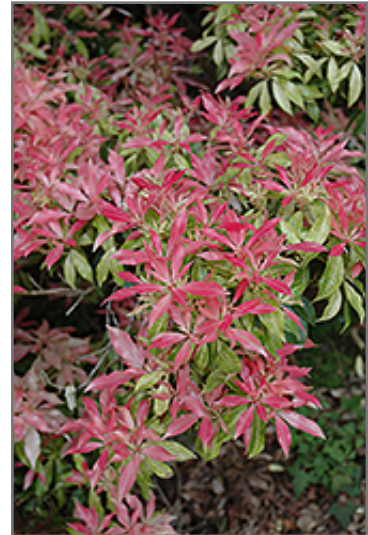
Valley Fire Japanese Pieris foliage