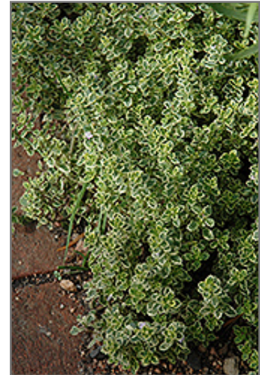
Aureus Lemon Thyme foliage