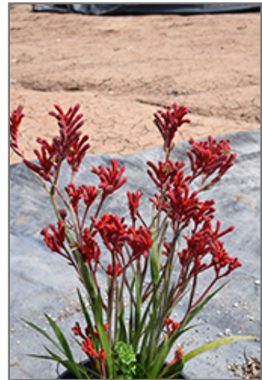
Kanga Red Kangaroo Paw in bloom