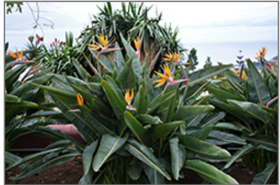
Orange Bird Of Paradise in bloom