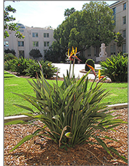
Orange Bird Of Paradise in bloom

Orange Bird Of Paradise is a fine choice for the garden, but it is also a good selection for planting in outdoor pots and containers. With its upright habit of growth, it is best suited for use as a 'thriller' in the 'spiller-thriller-filler' container combination; plant it near the center of the pot, surrounded by smaller plants and those that spill over the edges. It is even sizeable enough that it can be grown alone in a suitable container. Note that when growing plants in outdoor containers and baskets, they may require more frequent waterings than they would in the yard or garden.