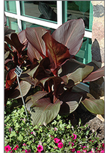
Tropicanna Black Canna

This plant should only be grown in full sunlight. It prefers to grow in moist to wet soil, and will even tolerate some standing water. It is not particular as to soil type or pH. It is highly tolerant of urban pollution and will even thrive in inner city environments. Consider applying a thick mulch around the root zone in winter to protect it in exposed locations or colder microclimates. This particular variety is an interspecific hybrid. It can be propagated by division; however, as a cultivated variety, be aware that it may be subject to certain restrictions or prohibitions on propagation.