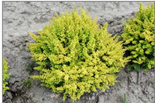
Sunsation Japanese Barberry

Sunsation Japanese Barberry is recommended for the following landscape applications;