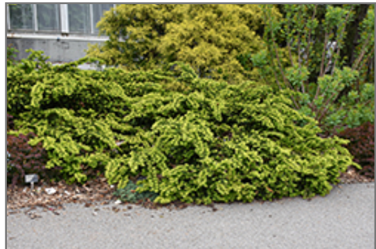
Emerald Spreader Yew