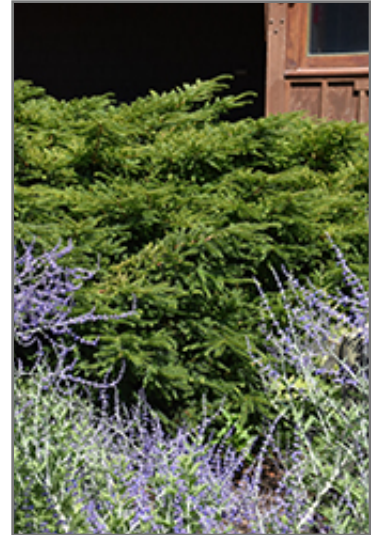
Emerald Spreader Yew

This shrub performs well in both full sun and full shade. However, you may want to keep it away from hot, dry locations that receive direct afternoon sun or which get reflected sunlight, such as against the south side of a white wall. It does best in average to evenly moist conditions, but will not tolerate standing water. It is not particular as to soil type or pH. It is highly tolerant of urban pollution and will even thrive in inner city environments, and will benefit from being planted in a relatively sheltered location. Consider applying a thick mulch around the root zone in winter to protect it in exposed locations or colder microclimates. This is a selected variety of a species not originally from North America, and parts of it are known to be toxic to humans and animals, so care should be exercised in planting it around children and pets.