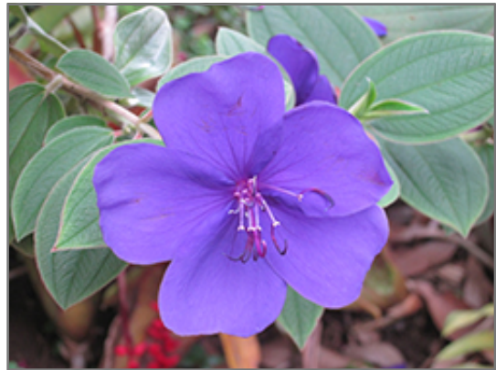
Princess Flower flowers

Princess Flower is recommended for the following landscape applications;