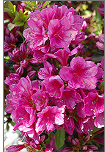
Girard's Purple Azalea flowers

Girard's Purple Azalea will grow to be about 3 feet tall at maturity, with a spread of 3 feet. It tends to be a little leggy, with a typical clearance of 1 foot from the ground. It grows at a slow rate, and under ideal conditions can be expected to live for 40 years or more.