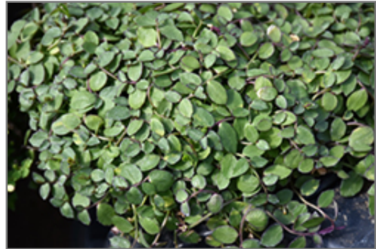
County Park Star Creeper foliage