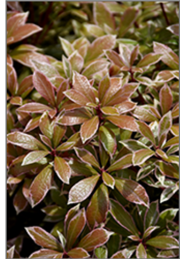
Little Heath Japanese Pieris foliage

This shrub does best in full sun to partial shade. It requires an evenly moist well-drained soil for optimal growth, but will die in standing water. It is very fussy about its soil conditions and must have rich, acidic soils to ensure success, and is subject to chlorosis (yellowing) of the foliage in alkaline soils. It is somewhat tolerant of urban pollution, and will benefit from being planted in a relatively sheltered location. Consider applying a thick mulch around the root zone in winter to protect it in exposed locations or colder microclimates. This is a selected variety of a species not originally from North America, and parts of it are known to be toxic to humans and animals, so care should be exercised in planting it around children and pets.