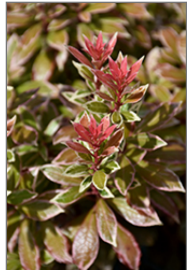
Little Heath Japanese Pieris foliage