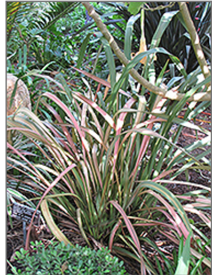
Jester New Zealand Flax