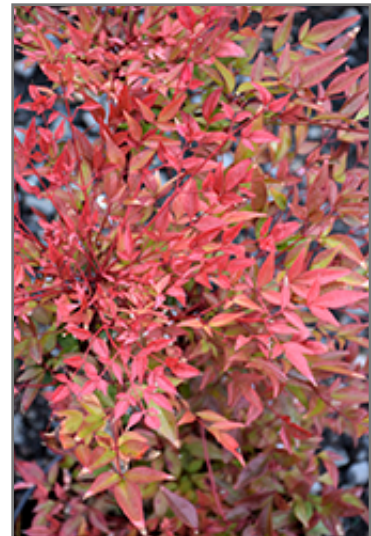
Obsession Nandina foliage