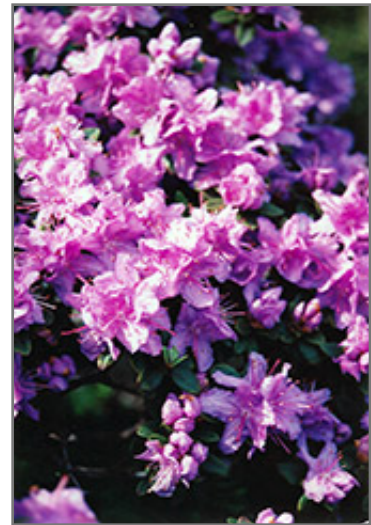
Ramapo Rhododendron flowers

Ramapo Rhododendron will grow to be about 3 feet tall at maturity, with a spread of 3 feet. It has a low canopy. It grows at a slow rate, and under ideal conditions can be expected to live for 40 years or more.