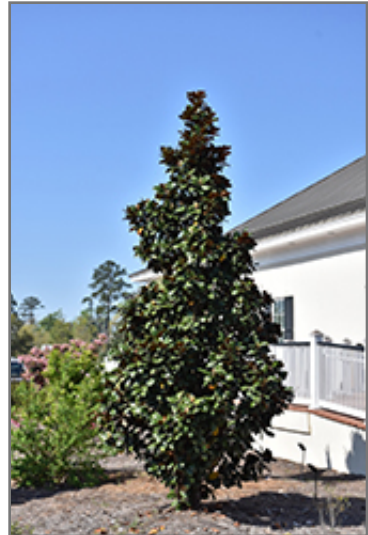
Teddy Bear Magnolia