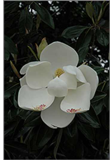
Teddy Bear Magnolia flowers