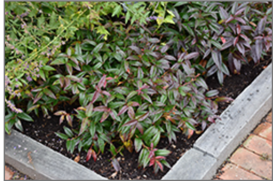
Scarletta Fetterbush

This shrub does best in partial shade to shade. It does best in average to evenly moist conditions, but will not tolerate standing water. It is not particular as to soil type, but has a definite preference for acidic soils. It is somewhat tolerant of urban pollution. This is a selection of a native North American species.