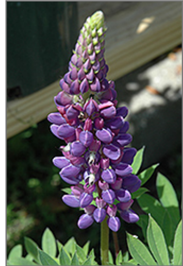
Gallery Blue Lupine flowers