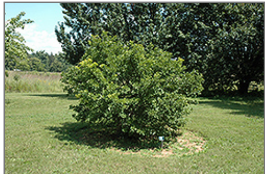
Jade Butterflies Ginkgo

Jade Butterflies Ginkgo is recommended for the following landscape applications;