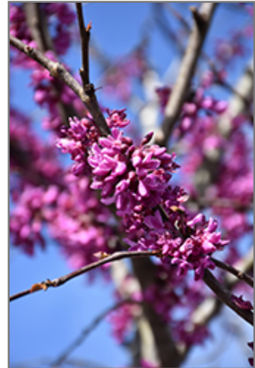
Eastern Redbud (tree form) flowers