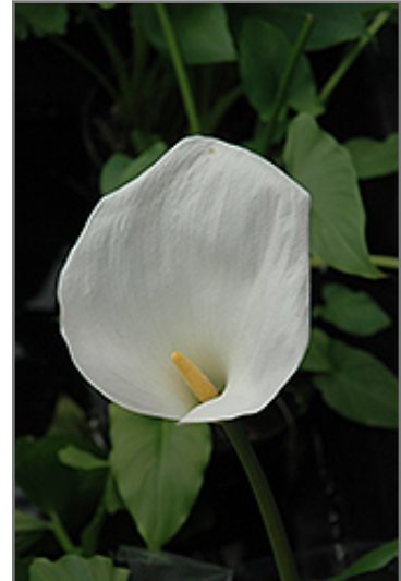
Calla Lily flowers