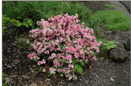
Gumpo Pink Azalea in bloom