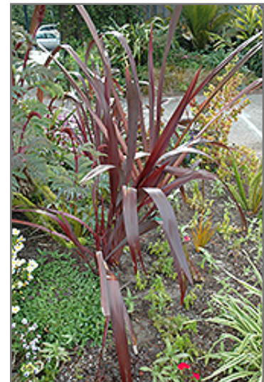
Amazing Red New Zealand Flax foliage