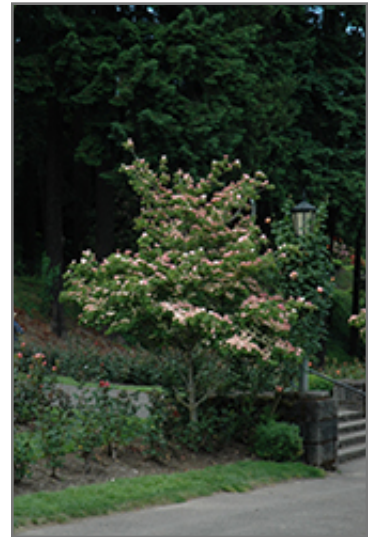
Heart Throb Chinese Dogwood in bloom