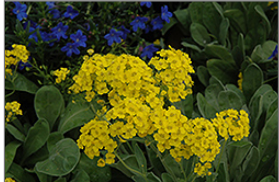
Basket Of Gold Alyssum flowers