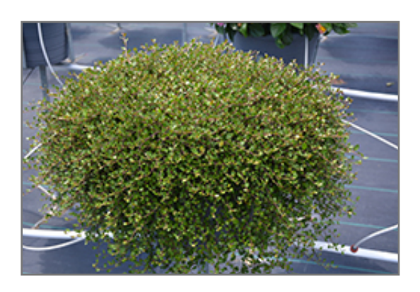
Wire Vine