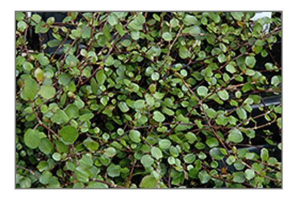
Wire Vine foliage