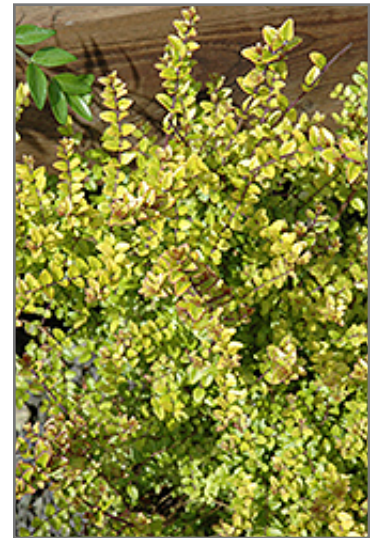
Baggesen's Gold Box Honeysuckle foliage

Baggesen's Gold Box Honeysuckle is recommended for the following landscape applications;