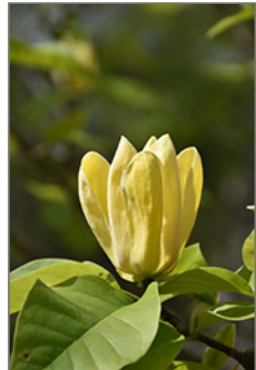
Yellow Bird Magnolia flowers