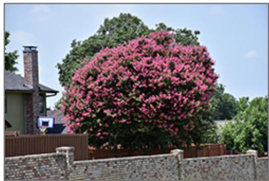
Zuni Crapemyrtle in bloom