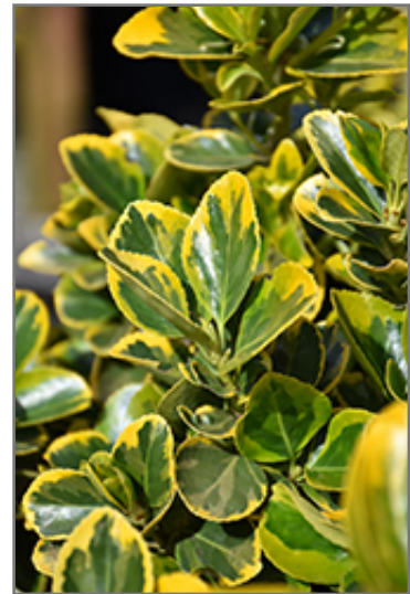
Gold Variegated Japanese Euonymus foliage