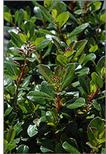
Pink Princess Escallonia foliage

This shrub does best in full sun to partial shade. It does best in average to evenly moist conditions, but will not tolerate standing water. It is not particular as to soil type or pH, and is able to handle environmental salt. It is somewhat tolerant of urban pollution. This particular variety is an interspecific hybrid.