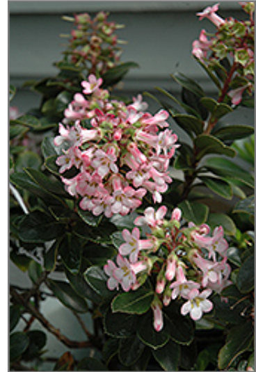
Pink Princess Escallonia flowers