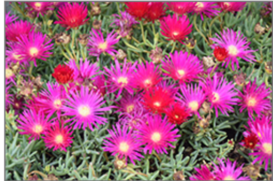
Purple Ice Plant flowers