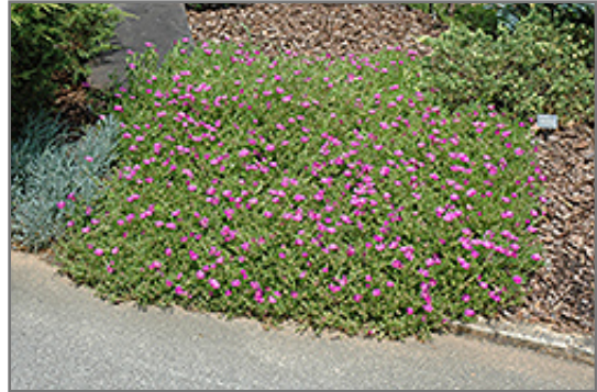
Purple Ice Plant in bloom

Purple Ice Plant will grow to be only 2 inches tall at maturity extending to 3 inches tall with the flowers, with a spread of 24 inches. Its foliage tends to remain low and dense right to the ground. It grows at a fast rate, and under ideal conditions can be expected to live for approximately 5 years. As an evergreen perennial, this plant will typically keep its form and foliage year-round.