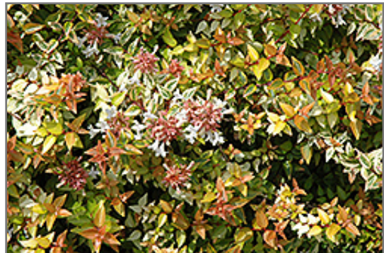
Kaleidoscope Abelia flowers

This shrub will require occasional maintenance and upkeep, and should only be pruned after flowering to avoid removing any of the current season's flowers. It is a good choice for attracting birds, bees and butterflies to your yard, but is not particularly attractive to deer who tend to leave it alone in favor of tastier treats. It has no significant negative characteristics.