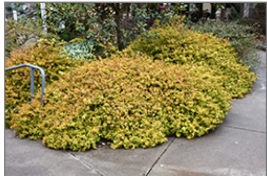
Kaleidoscope Abelia

Kaleidoscope Abelia will grow to be about 30 inches tall at maturity, with a spread of 4 feet. It tends to fill out right to the ground and therefore doesn't necessarily require facer plants in front. It grows at a slow rate, and under ideal conditions can be expected to live for approximately 30 years.