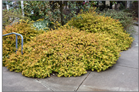
Kaleidoscope Abelia

Kaleidoscope Abelia will grow to be about 30 inches tall at maturity, with a spread of 4 feet. It tends to fill out right to the ground and therefore doesn't necessarily require facer plants in front. It grows at a slow rate, and under ideal conditions can be expected to live for approximately 30 years.