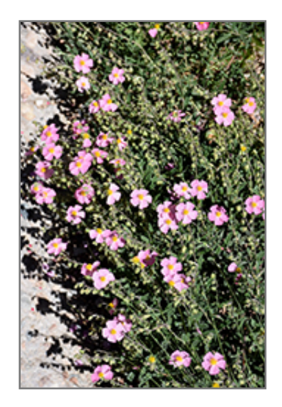
Common Rock Rose flowers