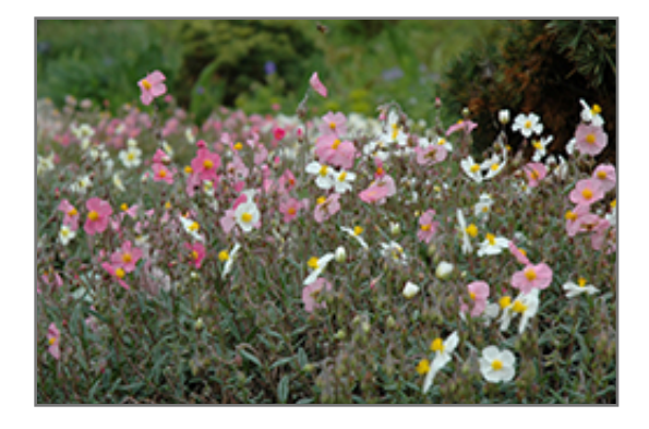
Common Rock Rose in bloom