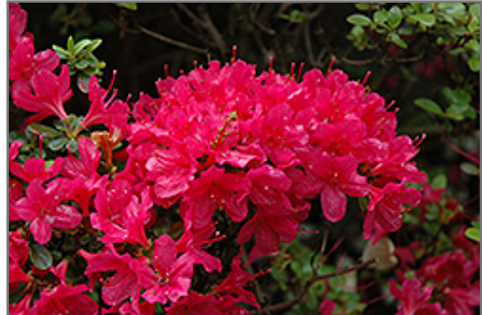
Hino Crimson Azalea flowers

This shrub does best in full sun to partial shade. You may want to keep it away from hot, dry locations that receive direct afternoon sun or which get reflected sunlight, such as against the south side of a white wall. It requires an evenly moist well-drained soil for optimal growth, but will die in standing water. It is very fussy about its soil conditions and must have rich, acidic soils to ensure success, and is subject to chlorosis (yellowing) of the foliage in alkaline soils. It is somewhat tolerant of urban pollution, and will benefit from being planted in a relatively sheltered location. Consider applying a thick mulch around the root zone in winter to protect it in exposed locations or colder microclimates. This particular variety is an interspecific hybrid.