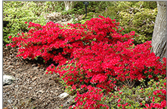
Hino Crimson Azalea in bloom