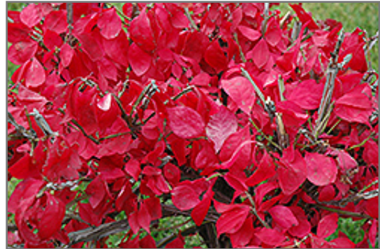
Compact Winged Burning Bush in fall